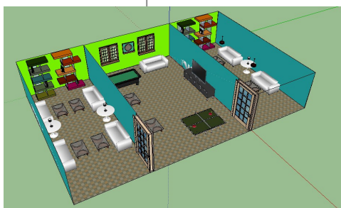
Student Lounge Space—by Connor W

Some students chose to redesign learning spaces we currently have at RSPS, such as a science lab or gymnasium. Other students chose to imagine new learning spaces, such as a student lounge or a rooftop garden.